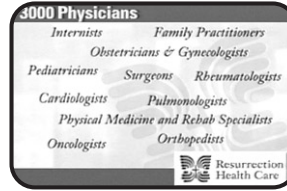
Resurrection Health Care "For All Of You..."