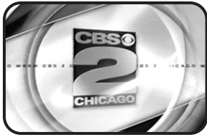
CBS 2 Chicago "News Topicals"