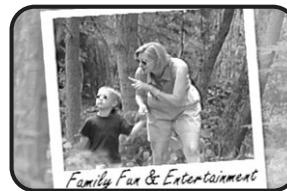
DuPage Convention & Visitor's Bureau "Picture Perfect"