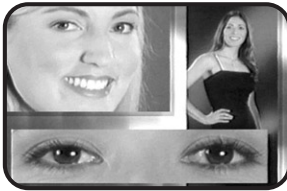
Lake Shore Plastic Surgery "Remember When..."