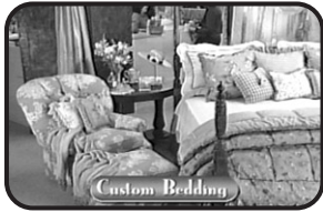
Calico Corners "Fabrics, Furniture..."