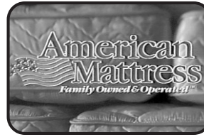
American Mattress (Promotion Specific)