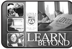
Loyola University "Learn Beyond"