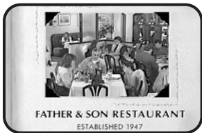
Marcello's "From Our House To Yours"