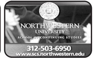
Northwestern University "Continuing Studies"