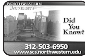
Northwestern University "Continuing Studies"