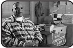
Salvation Army "Vehicle Donation Program"