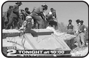
CBS 2 Chicago "News Topicals"