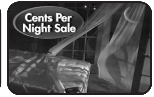
Cents Per Night Sale